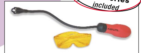
FLEX-Lite (Battery) (3) True UV LED's #413050