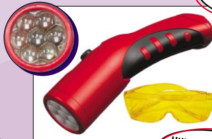
UV-Phazer 7 LED Cordless Light #413070

Utilizes leading-edge "Focusing Lens" Technology