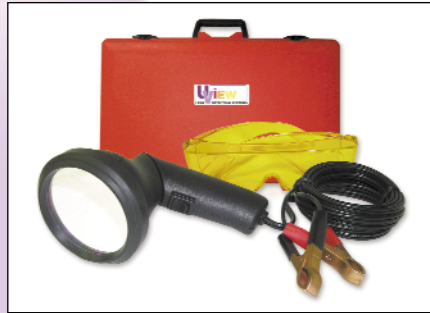
Micro/Megalite Kits (12v) #413000 (50w) #415000 (100w)

UVVIEW OFFERS FREE REPLACEMENT ON LIFETIME WARRANTY EVERY INJECTION GUN SOLD FOR LIFE