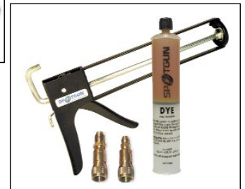
Competitors Conversion Kit #CCK