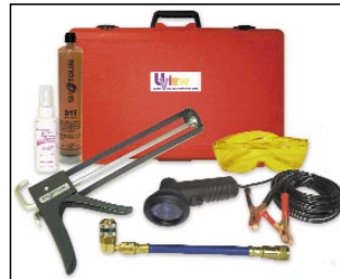
Spotgun & Micro/Megalite Kit #414515E #415415