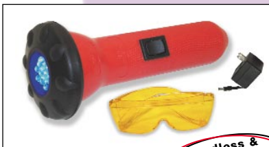
MicroLED-Lite (12) True UV LED's #413060